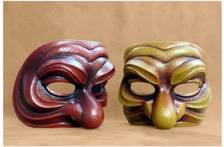
Commedia dell'arte masks

Noises Off is a prime example of farce cited in many modern-day discussions of the genre. Frayn's play perfectly matches the following definition: "a comedy that depends on an elaborately contrived, usually improbable plot, broadly drawn stock characters, and physical humor. Most farces are amoral and exist to entertain."