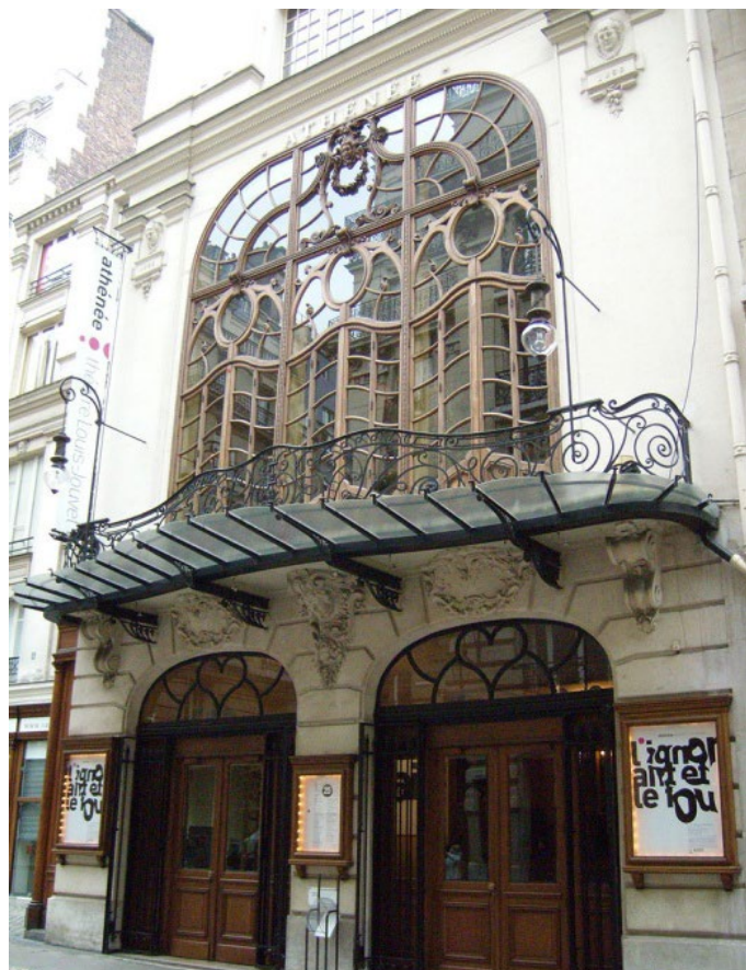
Exterior of Théâtre de l'Athénée. Photograph. Paris.